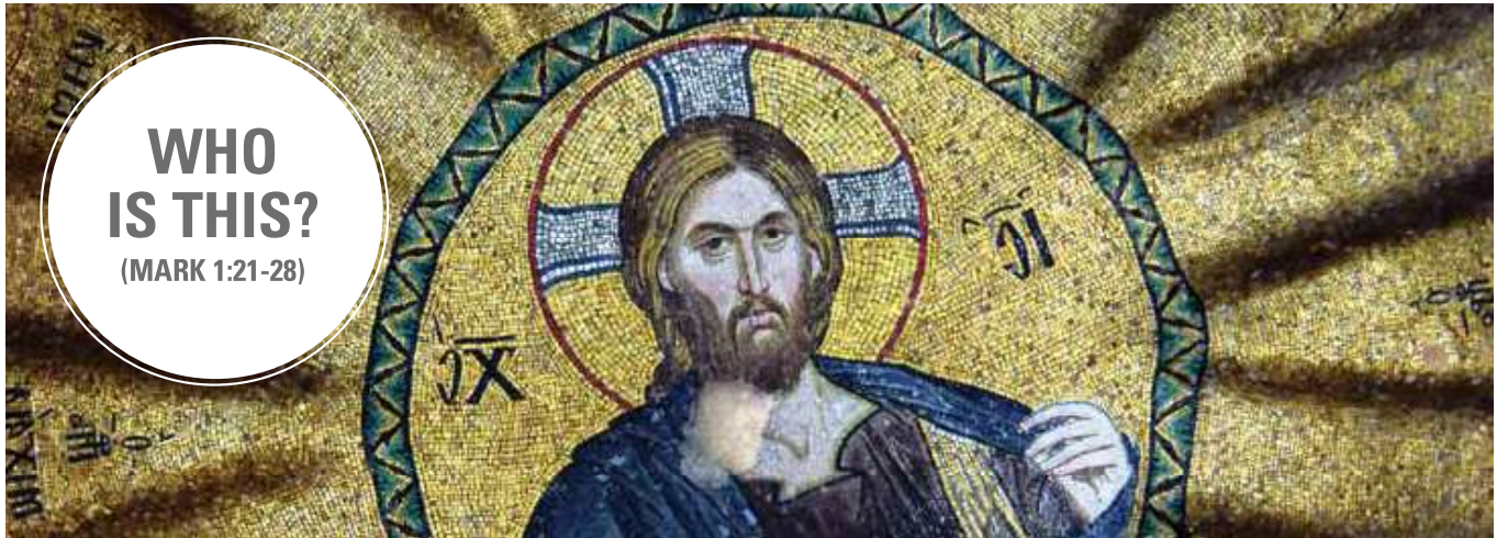
Image of Christ from the cupola of Pammakaristos Church, Istanbul, Turkey

Capernaum is the base for Jesus' ministry in Galilee and the incident in the synagogue there is the first public act of Jesus' ministry after his rather private gathering of companions for his mission.