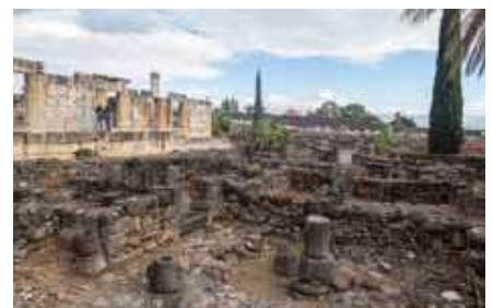
Roman ruins at Capernaum. Capernaum was a fishing village on the northern shore of the Sea of Galilee.

The synagogue was a place of prayer and instruction: the Temple was the place of sacrifice.